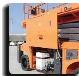
Vertical Style Lift Gate