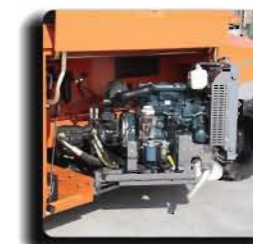
Swing-out Engine Tray