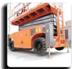
Automatic Leveling Outriggers