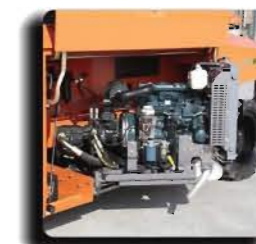
Swing-out Engine Tray