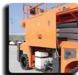
Vertical Style Lift Gate