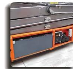
Removeable Battery Cover