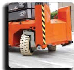
Compact Turning Radius