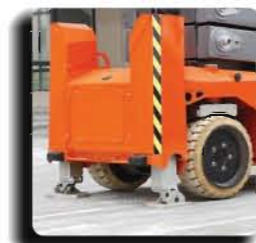
Automatic Leveling Outriggers