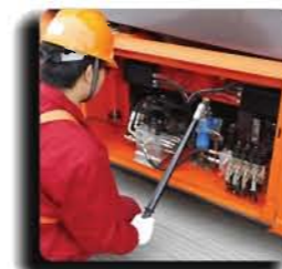
Emergency Lowering System