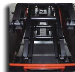
Fully Protected Chassis