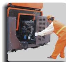
Slide-Out Engine Tray