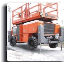
Automatic Leveling Outriggers