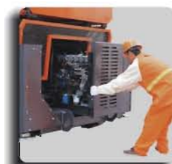
Slide-Out Engine Tray