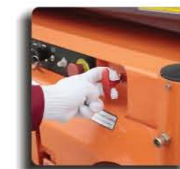
Emergency Lowering System