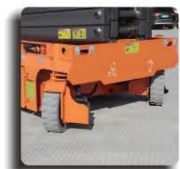
Compact Turning Radius