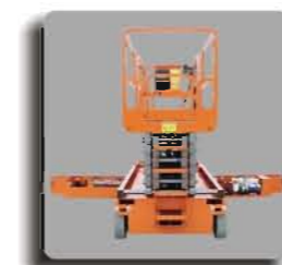
Swing Out Tray