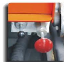
Brake Release Valve