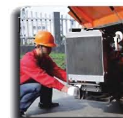
Swing-out Engine Tray