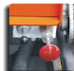
Brake Release Valve