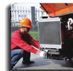
Swing-out Engine Tray