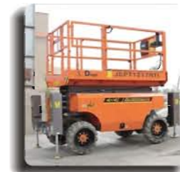
Automatic Leveling Outriggers