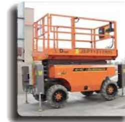
Automatic Leveling Outriggers