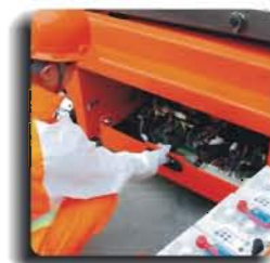
Slide-out Components Tray