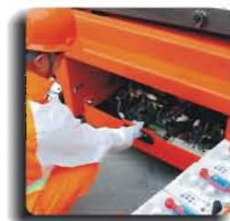
Slide-out Components Tray