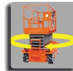
Omni-direction Driving System