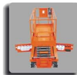
Swing Out Tray