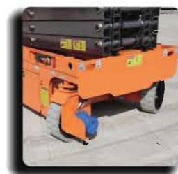
Compact Turning Radius