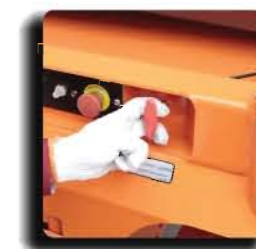
Emergency Lowering System