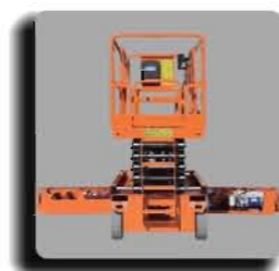
Swing Out Tray