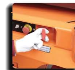
Emergency Lowering System