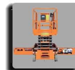
Swing Out Tray