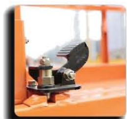
Platform Extension Footlock