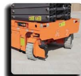
Compact Turning Radius