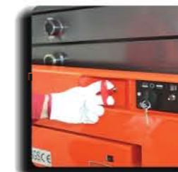
Emergency Lowering System