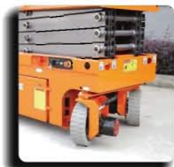
Compact Turning Radius