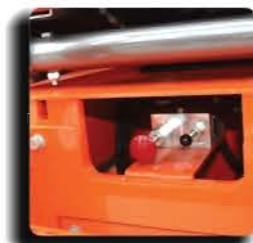
Brake Release Valve