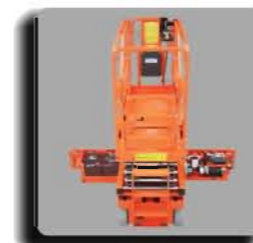
Swing Out Tray