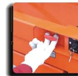
Emergency Lowering System