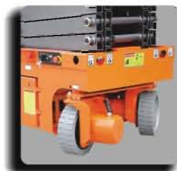
Compact Turning Radius