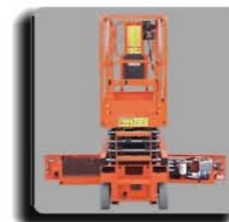
Swing Out Tray