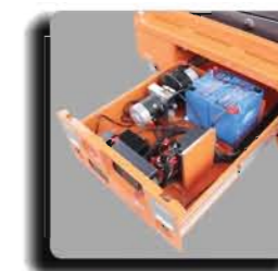
Slide Out Tray