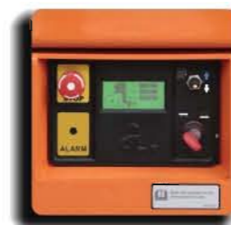
Touch Display Screen