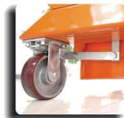
Automatic Brake System-Option