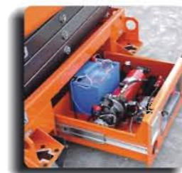
Slide Out Tray