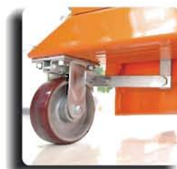
Automatic Brake System-Option