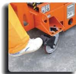
Castor With Brake