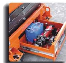
Slide Out Tray