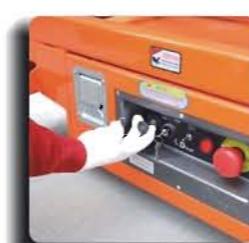
Emergency Lowering System