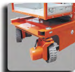
Tight Turning Radius