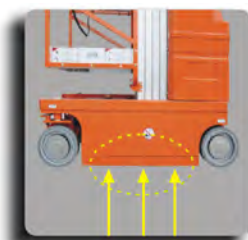
Automatic Pothole Protection